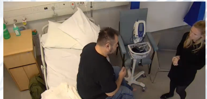
↑ Sim4MentalHealth Hybrid event