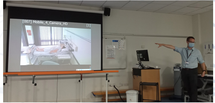
↑ Faculty Development Day